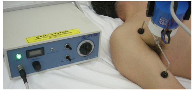
Fig 1. Focal vibratory device and application setting to the upper limb.

During rMV, the participants were supine, and they were requested to contract the treated muscles. The assessors (F.C. and C.C.) monitored the muscular contraction throughout the series of applications. Figure 1 shows a typical treatment setting. In the SG, rMV was simultaneously applied to the pectoralis minor and the biceps brachii of the affected limb. During another session on the same day, 1 transducer was applied to the flexor carpi muscle. The mechanical applications were applied over 3 consecutive days. For each muscle, the applications consisted of 3 vibration sessions, each with a duration of 10 minutes. A 1-minute interval separated the sessions. During the intervals, rMV was interrupted and the subject was requested to relax the muscle. The CG participants